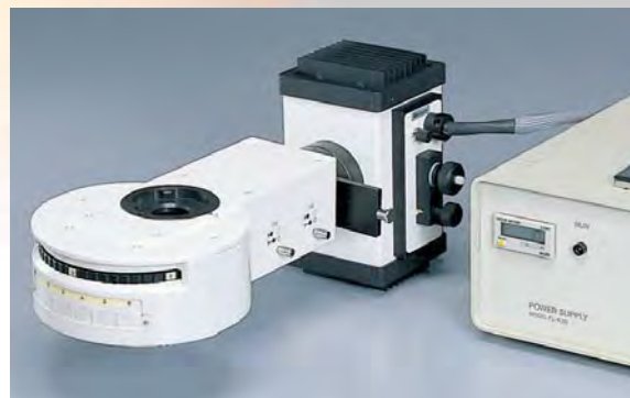
MT-EPI-2 EPI FLUORESCENT ATTACHMENT SET