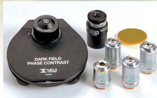
ZERNIKE PHASE CONTRAST SET