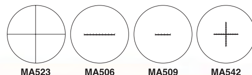
MA523 MA506 MA509 MA542