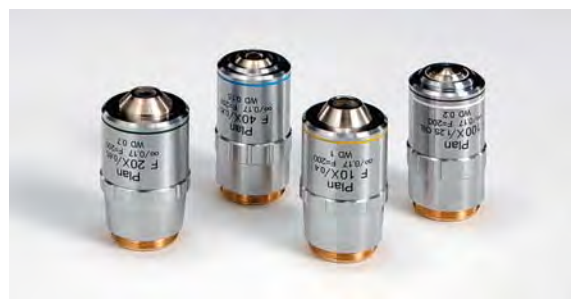
OBJECTIVES FOR FLUORESCENT MICROSCOPY