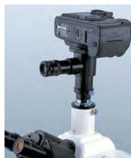
MA150/60 Camera attachment

These attachments are used to mount the camera with T2 adapter ring to the photo tube.