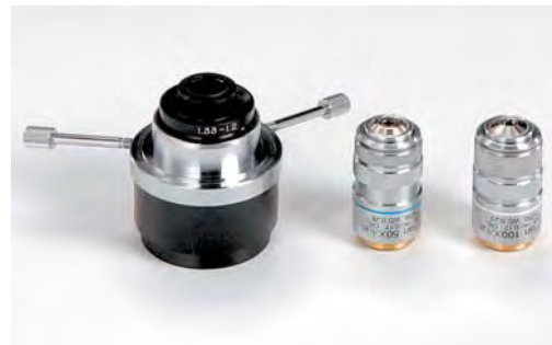
DARKFIELD CONDENSER AND OBJECTIVES WITH IRIS DIAPHRAGM