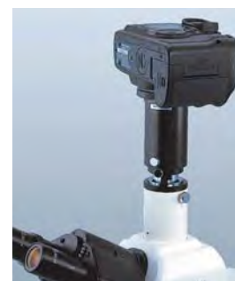
MA150/50 Camera attachment